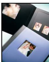
Custom & Digital Flush Mount $800-$1500