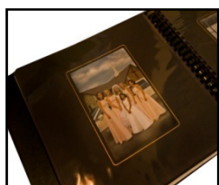
Basic Album $300

Albums: We carry more than 2500 styles of albums ranging in price from $50 for a simple 4X6 album to $1500 for flush mount coffee table digital albums and hand-crafted Italian leather bound albums. Prices below are for ala-carte album purchases and do not include assembly or prints.