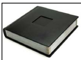
Traditional Upgraded Album $600