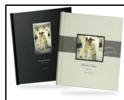
Coffee Table $25-$150-$600